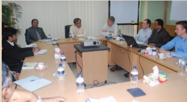
ASA International and CMI team in a meeting at Operational Headquarters, Dhaka, Bangladesh