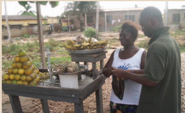
One client in Ghana

Catalyst Microfinance Investors (CMI) ( www.catalyst-microfinance.com ), equity provider of ASA International, is a limited liability company having USD 125 Million as investment fund for microfinance operation in Asia and Africa. Shareholders of CMI are world famous financial organizations, private equity funds, private investors and pension funds. ASAI is a greenfield microfinance institution and 100% owned by CMI. ASA provides all kinds of operational supports to ASAI to operate microfinance program in different